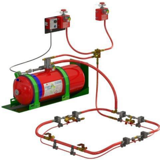
LOP COMPACT System Assembly